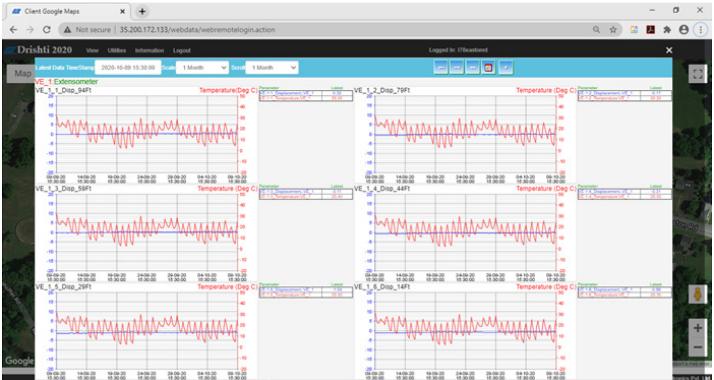
Multipoint Borehole Extensometer data